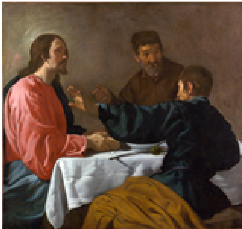
Velázquez, Diego, 1599-1660

An Open and Affirming Congregation of the United Church of Christ